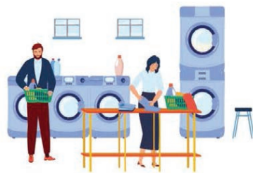
Control Laundry application